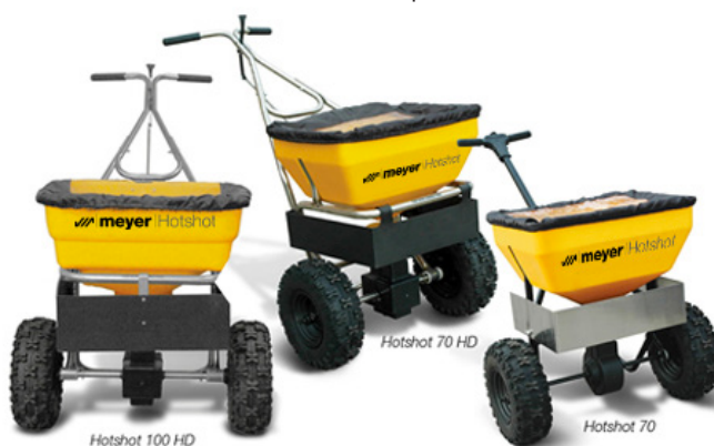
Hotshot 100 HD